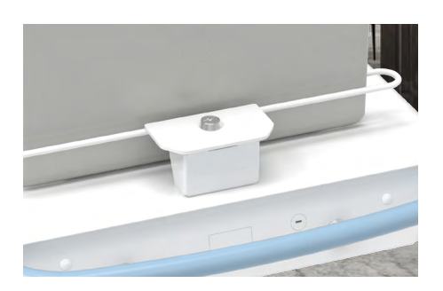
Podium laptop lock (key lock)