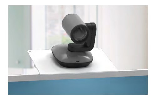
Telemedicine camera mounts